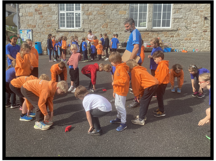
Children demonstrated great team work and imagination in our Paul Feast games. Congratulations to Gwynver House for winning!